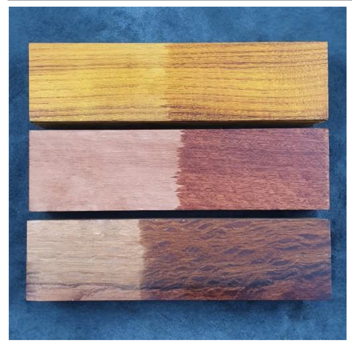
Fig.1: Before and after.